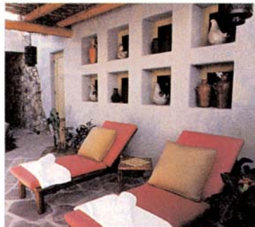
THE ESPERANZA RESORT CABO SAN LUCAS, MEXICO

Starred (and star-studded) retreats for tying the knot