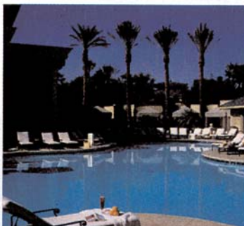
FOUR SEASONS HOTEL LAS VEGAS