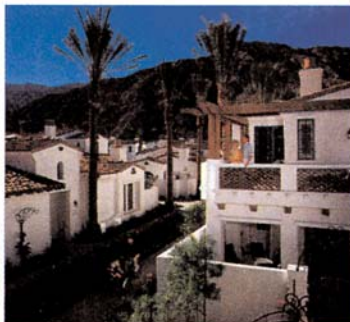
LA QUINTA RESORT & CLUB PALM SPRINGS, CALIF.