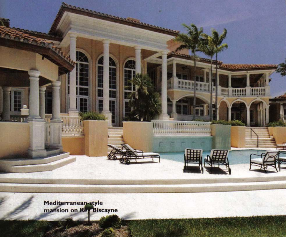
Mediterranean-style mansion on Key Biscayne

Of course, no Tuscan estate would be complete without a culinary component. The grounds of Castello di Casole have black truffles to be hunted and cooking and wine classes will be available. Grapes and olives are harvested from the property, and wine and oil are bottled under the estate's private label. Prices range up to $6 million for full ownership. For more information, visit castellodicasole.com .