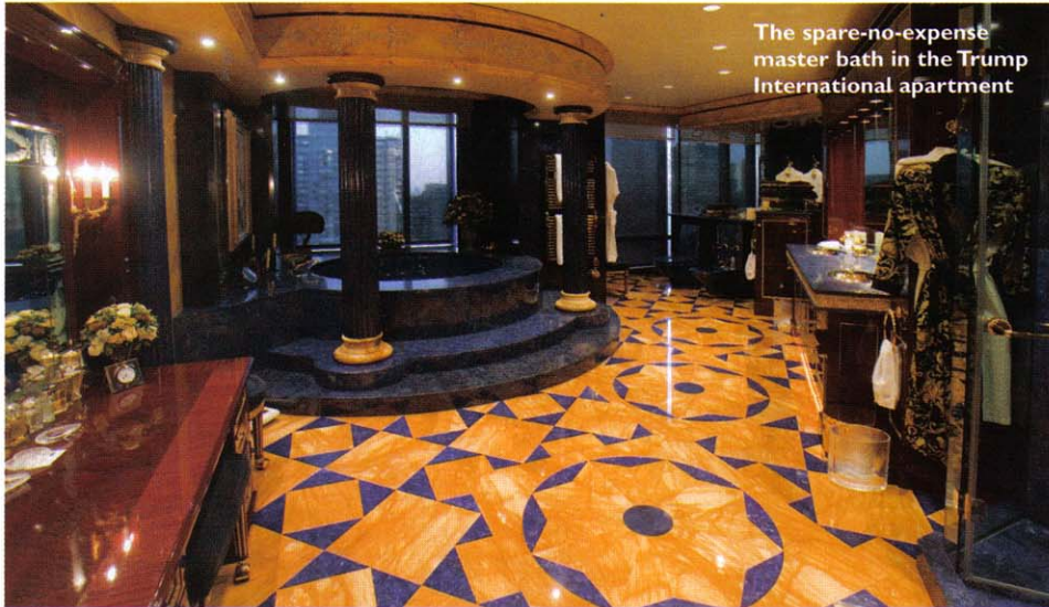
The spare-no-expense master bath in the Trump International apartment

an entertainment set is cleverly concealed along one wall. The extraordinary attention to detail extends to every corner of the home. Brass rods in the custom closets pull out at a touch. Twin wine coolers are concealed behind mahogany doors. The eat-in chef's kitchen has a sound and odor-proof glass door separating it from the rest of the home—though who needs a kitchen when you have Jean-Georges downstairs?