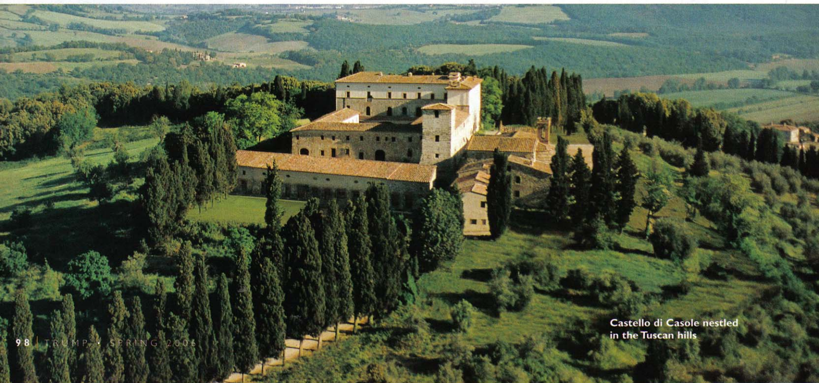
Castello di Casole nestled in the Tuscan hills

The classic villas will have a host of sumptuous details, from Frette sheets to hand-set travertine floors to Philippe Starck fixtures. Though each one is unique, all seven compounds feature guest residences, infinity pools lined in Italian tile, and outdoor fireplaces. The homes are individually furnished with fine antiques and contemporary pieces. Castello di Casole provides luxury services to all owners—a personal chef, daily housekeeping, wireless Internet access—so they can turn their attentions to hiking, biking, touring, or simply enjoying the views of the gently folding land.