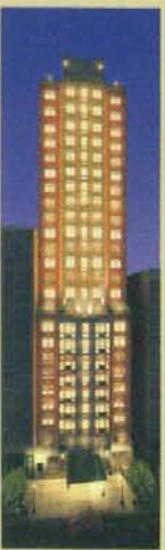
Development: Sutton 57 Location: New York, N.Y.

A look at how prices compare in various high-end communities. Below are homes within private club settings that offer golf courses.