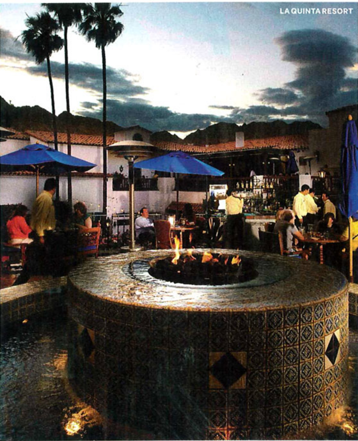
LA QUINTA RESORT