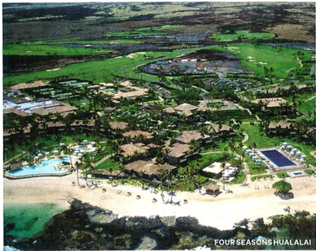
FOUR SEASONS HUALALAI