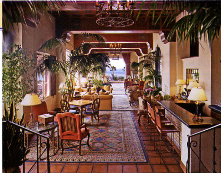
La Sala and its adjacent terrace at La Valencia Hotel are the ideal place for sunset cocktails. Enjoy live music every evening.