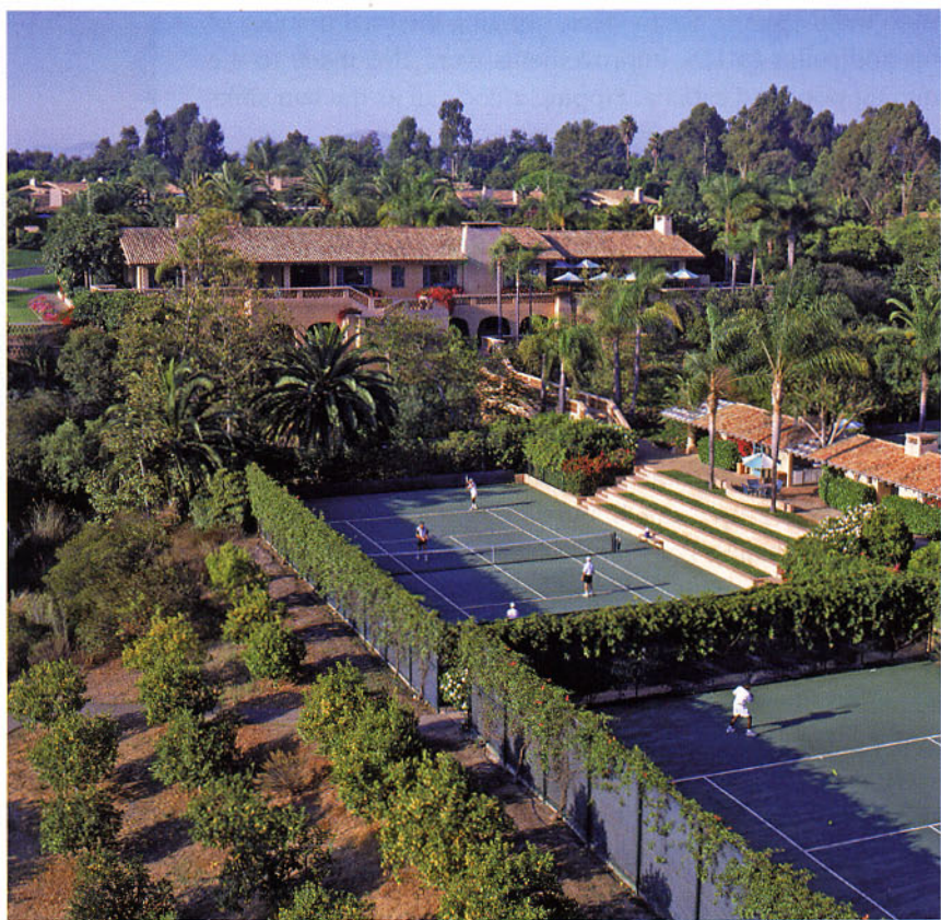
Rancho Valencia near Del Mar is widely considered one of the top tennis resorts in the nation.

garden patios. Accommodations include 26 casitas with 49 beautifully appointed one- and two-bedroom suites. Each suite is accented by exposed white-washed beams, ceiling fans, cathedral ceilings, earth-tone stucco walls, clay tile roofs, glazed tile bordered fireplaces, plantation shuttered windows and French doors leading to a private patio shaded by an array of exquisite flowers. You can hear the tennis balls in the distance as you dip into the plunge pool with a glass of Krug and a plate of fruit.