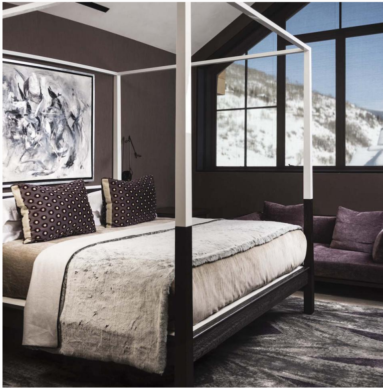
The Grand Galerie Penthouse is Vail's most exclusive and exceptional accommodation available to ... [+] THE SEBASTIAN - VAIL