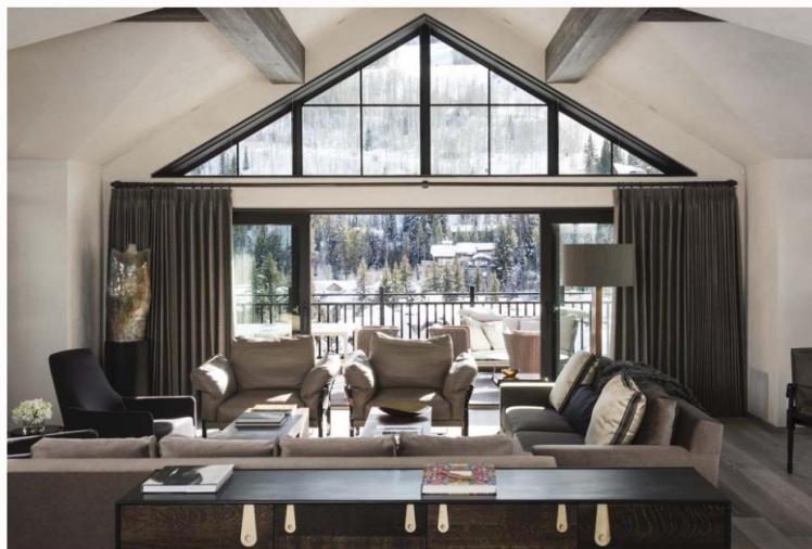
The Grand Galerie Penthouse is a new addition to The Sebastian – Vail's hospitality offerings and is now available to the public for overnight stays. [-] THE SEBASTIAN - VAIL

Featuring a 24-hour private concierge service, slope-side ski valet and 5,300-square-foot overlooking Vail mountain, the Grand Galerie Penthouse can be yours for $18,000 a night.