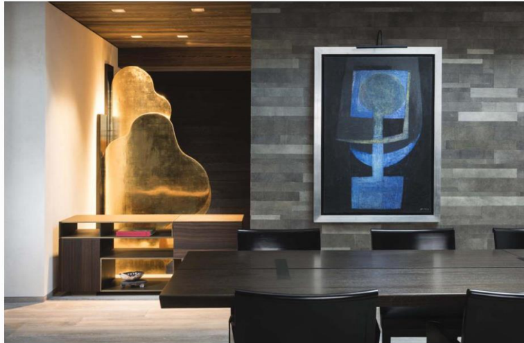
Nestled in the heart of the residence is a stunning dining space crowned with a cathedral skylight spanning the entire length of the room, allowing natural sunlight to fully illuminate the space during the day. [-] THE SEBASTIAN - VAIL

At the center of this spacious abode, is the stunning dining-room space which is crowned with a cathedral skylight that spans the entire length of the room and allows natural sunlight to keep the space fully illuminated during the day.