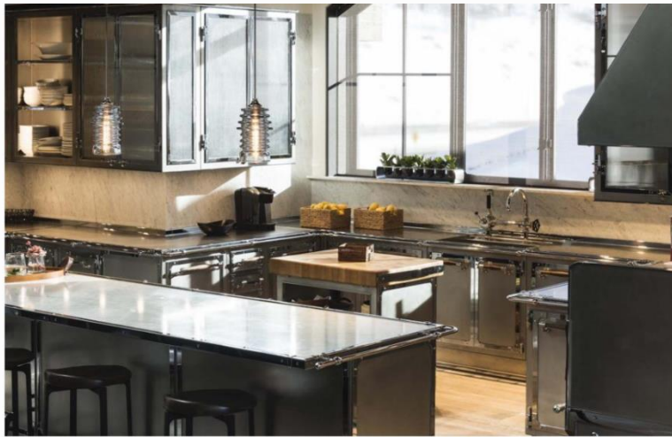
A stay at The Grand Galerie Penthouse features Timbers Resort's hallmark five-star services such as 24-hour concierge service and special daily provisions from The Sebastian – Vail's executive chef.